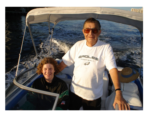
This is a photo of Dad, a die-hard Eagles fan, at the helm, teaching my son how to navigate!